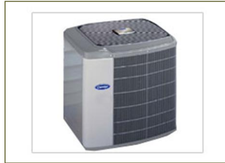
Carrier Units provide superior quality and comfort for any home.

Carrier Dealers, like Wilhelm, are experts in HVAC and wanted to pass on the knowledge.